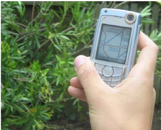
Figure 2: Shows ImageZoomViewer running with a subway map. Facetracking is used to pan and zoom on the picture.

ImageZoomViewer, DrawME and Layered Pie Menu are examples of applications that run on the phone. ImageZoomViewer is an application for panning and zooming large pictures by moving the device in the 3D space (figure 2). DrawME recognized a hand drawn symbol inside a circle and this icon can be used as a short cut for calling e.g. a phone number (only with the circle algorithm) and Layered pie menu present a pie menu in which the user browse through the different layers of the menu by moving the device closer or further away. An item can be selected by moving the device away from the center.